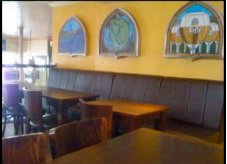
Main Bar and Mezzanine – Lowlander Drury Lane